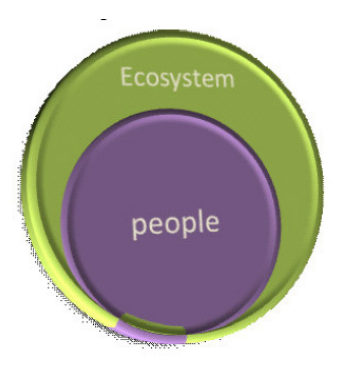
Fig. 3. The Egg of Sustainability.

Thus we see that Urban Farming can be sustainable if it has Environmental Integrity, Economically Resiliant, Promotes Social Wellbeing and is backed with Supportive Governmental Policies.