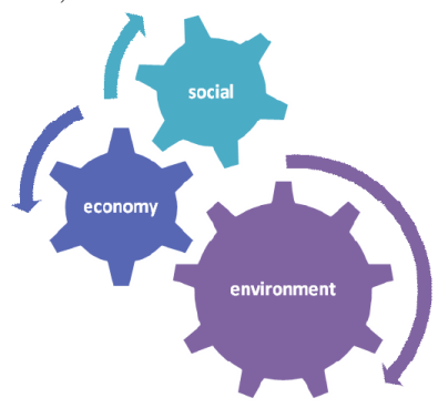
Fig.1. Three pillar basic model.

Three Pillars Basic Model has three vital dimensions which are interdependent and together they make for sustainability- Environmental Dimension, Economic Dimension, Social dimension